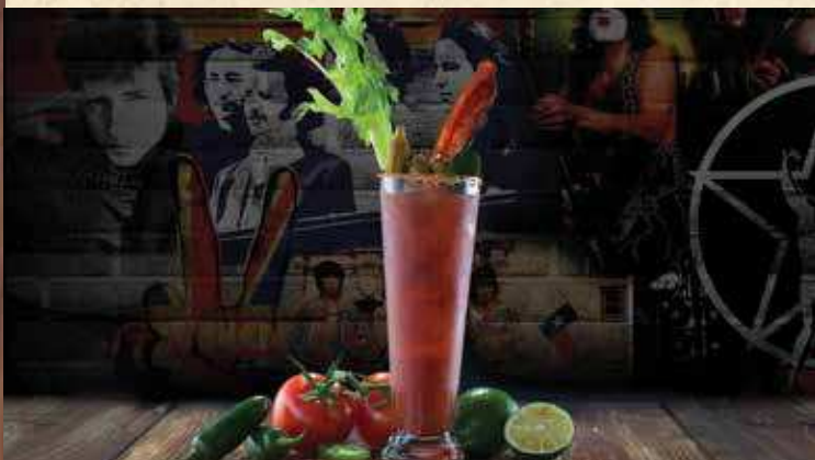
ALMOST FAMOUS CREOLE BLOODY MARY